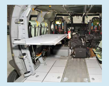
Hinged litter platforms and support arms easily remove for storage in the integrated box outboard of the AP Seats.