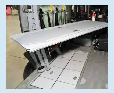
Litter platform is secured on support arms that telescope and rotate, allowing crew to change the angle and position of the platform.