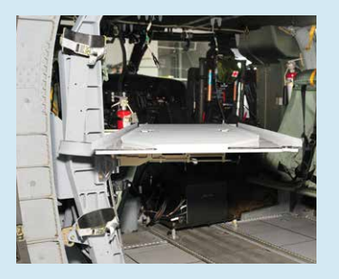
The litter slides onto platform via channels ensuring smooth and safe loading. Platform is then returned to flight position and locked for taxitakeoff-landing.