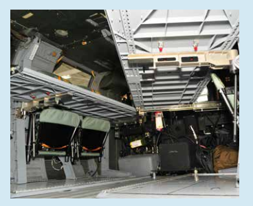
Track style mounting is provided under the upper platform, on the base pallet, and on the aft stanchion for mounting restraints, utility equipment, and medical IV bags.